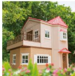
Large Red Roof House