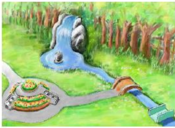
Sparkle Lake and Humming River

Sylvanian Park is an outdoor attraction with a Sylvanian village that covers about 3,320 square meters. Visitors will see two signature Sylvanian village sights: Sparkle Lake and Humming River. Another attraction is the Large Red Roof House where the Chocolate Rabbit family lives. The Chocolate Rabbit girl will speak to people who stand in front of furniture or dolls inside the house. Furthermore, visitors can enjoy miniball pool in the family cottage.