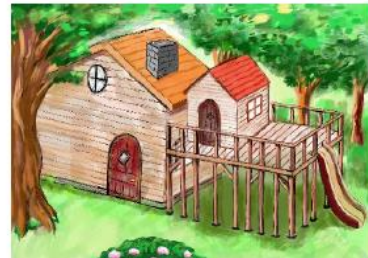
Exciting tree house and family cottage

Visitors can dress up like the Chocolate Rabbit girl or the Walnut Squirrel boy to feel like a member of the Sylvanian Family and enjoy their time at the village.