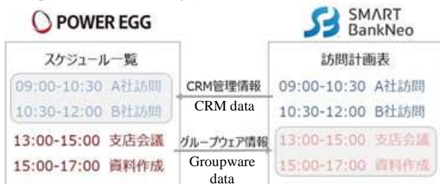
(Example 1) Schedule linkage