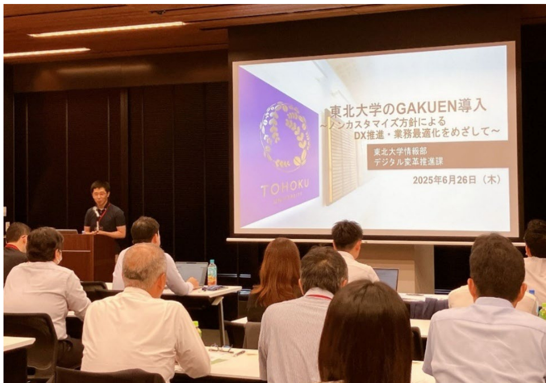
The Tohoku University presentation at the GAKUEN seminar