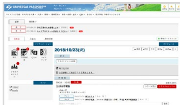
Example of a GAKUEN page

Product website: https://www.jast-gakuen.com/